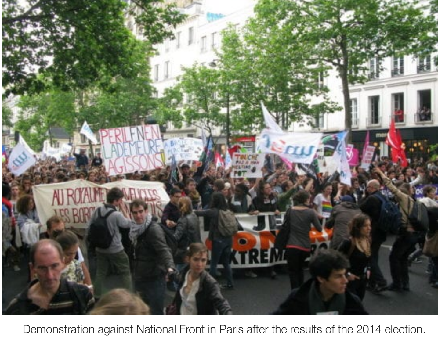
Demonstration against National Front in Paris after the results of the 2014 election.

WRITTEN BY GARY ZABEL POSTED OCTOBER 29, 2017 FILED UNDER: NEWS+OPINIONS, OP-ED